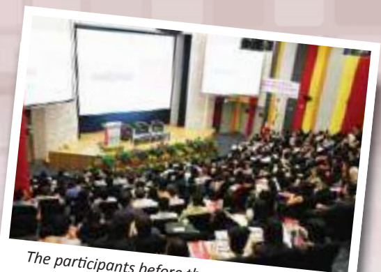
The participants before the commencement of the talk