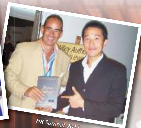
HR Summit 2011