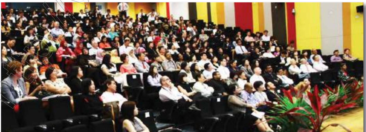
Participants at the International Women's Day forum

The event not only served to inspire women's minds, but also acted as a reminder that many opportunities were available for those who wished to achieve their dreams.