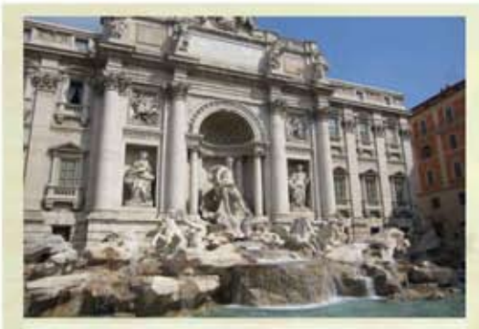
The spectacular Trevi Fountain, one of the most famous fountains in the world.