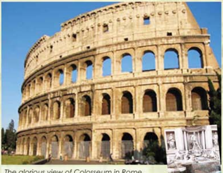
The alorious view of Colosseum in Rome.