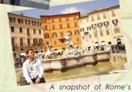
artistic heritage, Piazza Novona.

They say that when you're in Rome, you do as the Romans do. But if you get a chance to visit the city of Rome, the one thing you are likely to find yourself doing is marvel at the remains of a city filled with rich history and glory.